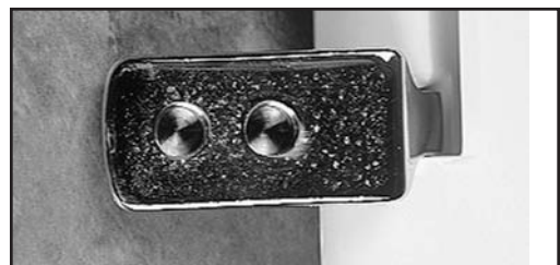
TWO-POSITION HINGE FITS ROUND AND ELONGATED BOWLS