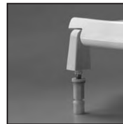
STA-TITE ® , COMMERCIAL FASTENING SYSTEM ™ , ONE-PIECE INTEGRATED NUT AND WASHER