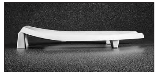
ADDITIONAL 2" OF HEIGHT