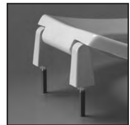
EXTERNAL CHECK HINGE WITH 300 SERIES STAINLESS STEEL BOLTS