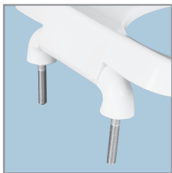
PLASTIC HINGES WITH STAINLESS STEEL POSTS AND PINTLES