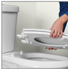
EASY REMOVAL OF SEAT FOR THOROUGH CLEANING