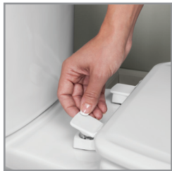
LIFT HINGES TO UNLOCK