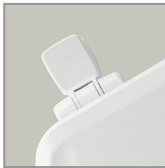
PLASTIC WHISPER•CLOSE® WITH EASY•CLEAN & CHANGE® HINGES