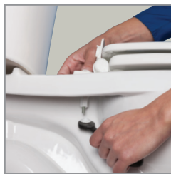
STA-TITE® SEAT FASTENING SYSTEM™